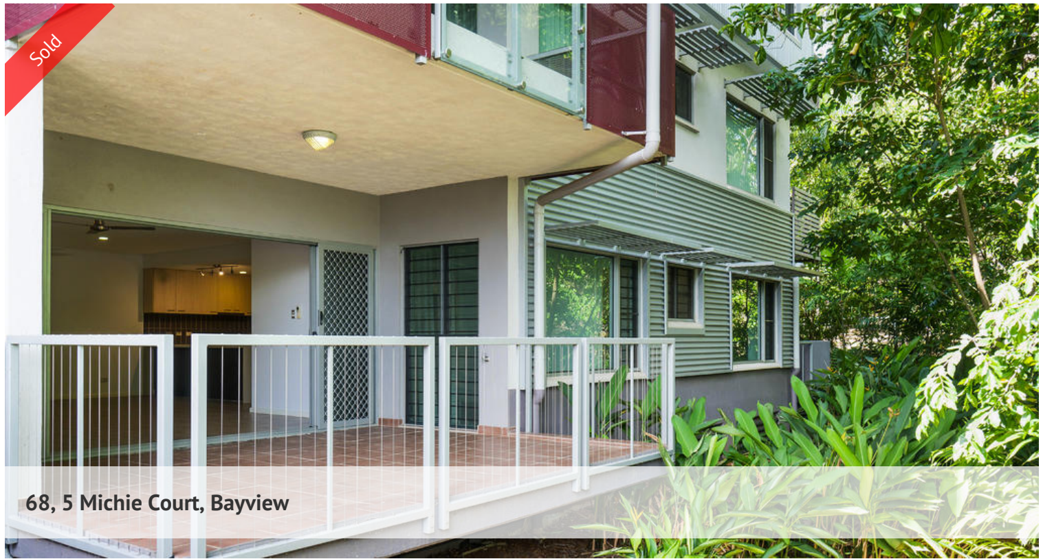
68, 5 Michie Court, Bayview