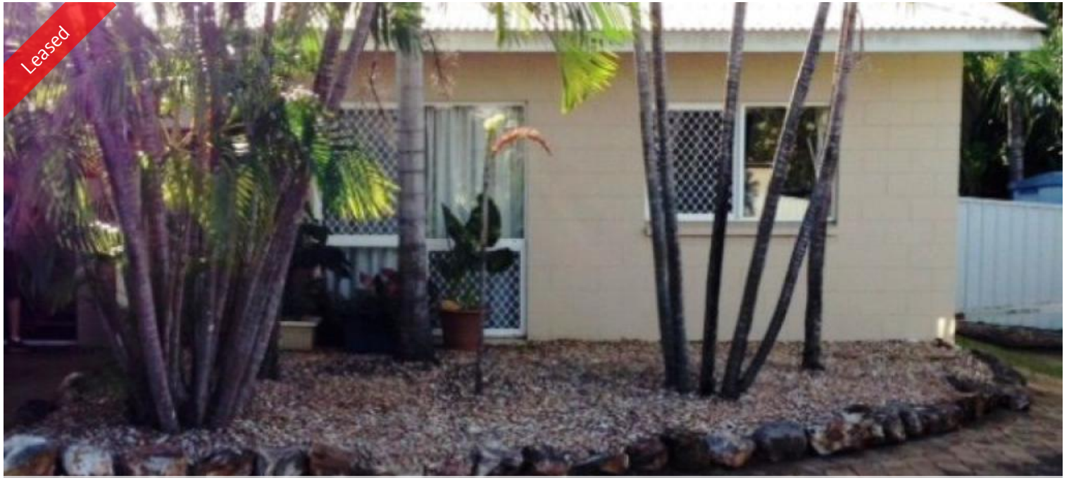
Unit, 7/6 Timpson Court, Gray