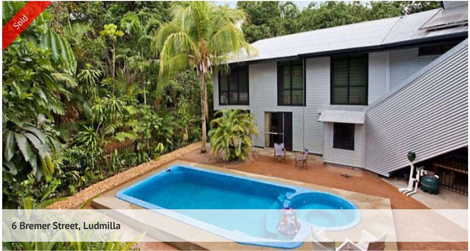
6 Bremer Street, Ludmilla