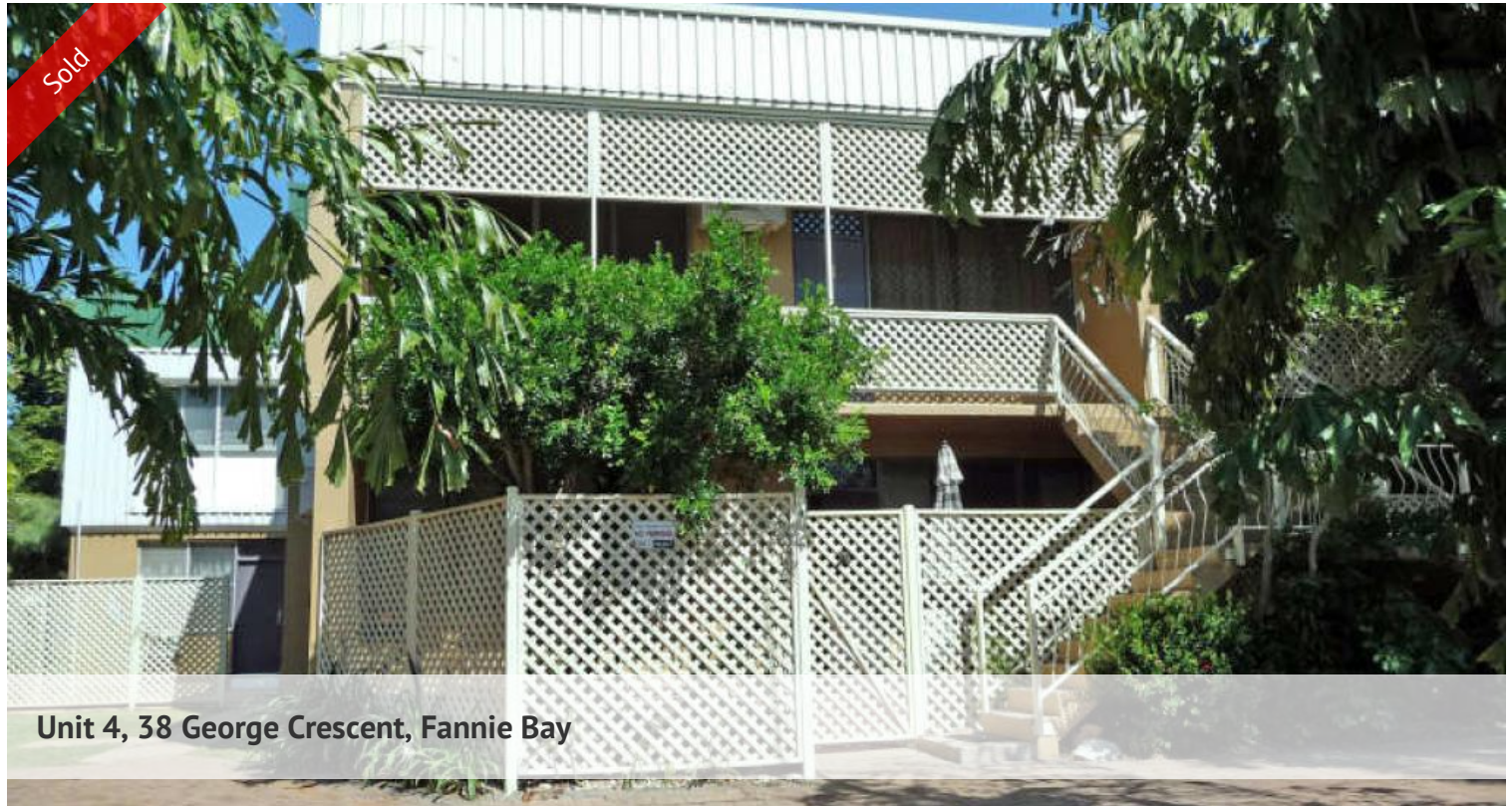
Unit 4, 38 George Crescent, Fannie Bay