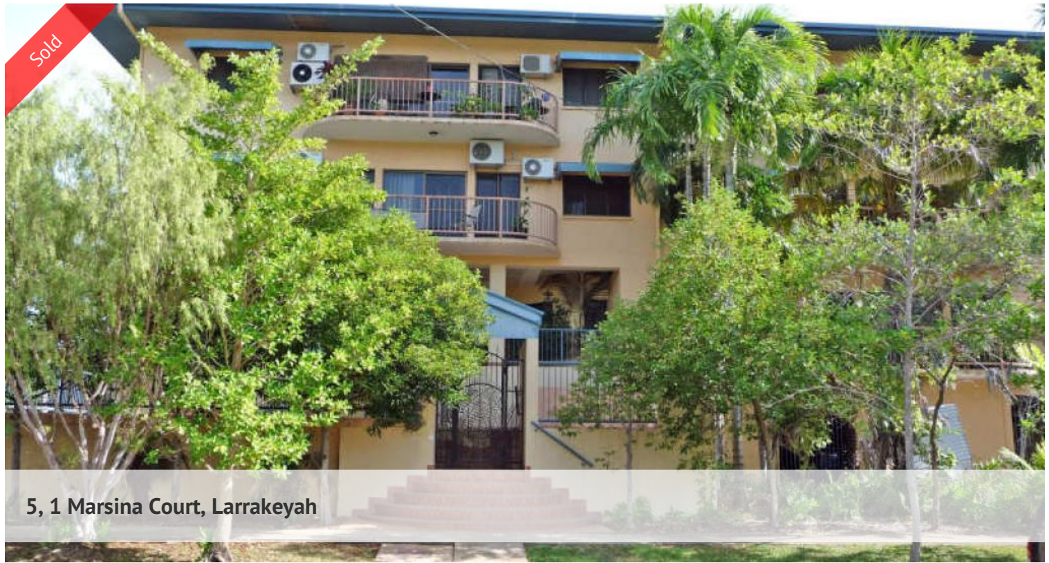
5, 1 Marsina Court, Larrakeyah