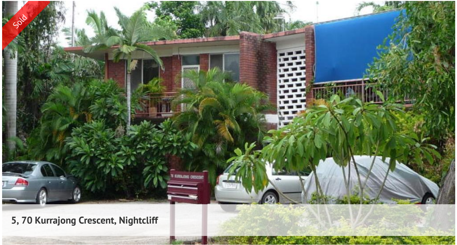
5, 70 Kurrajong Crescent, Nightcliff