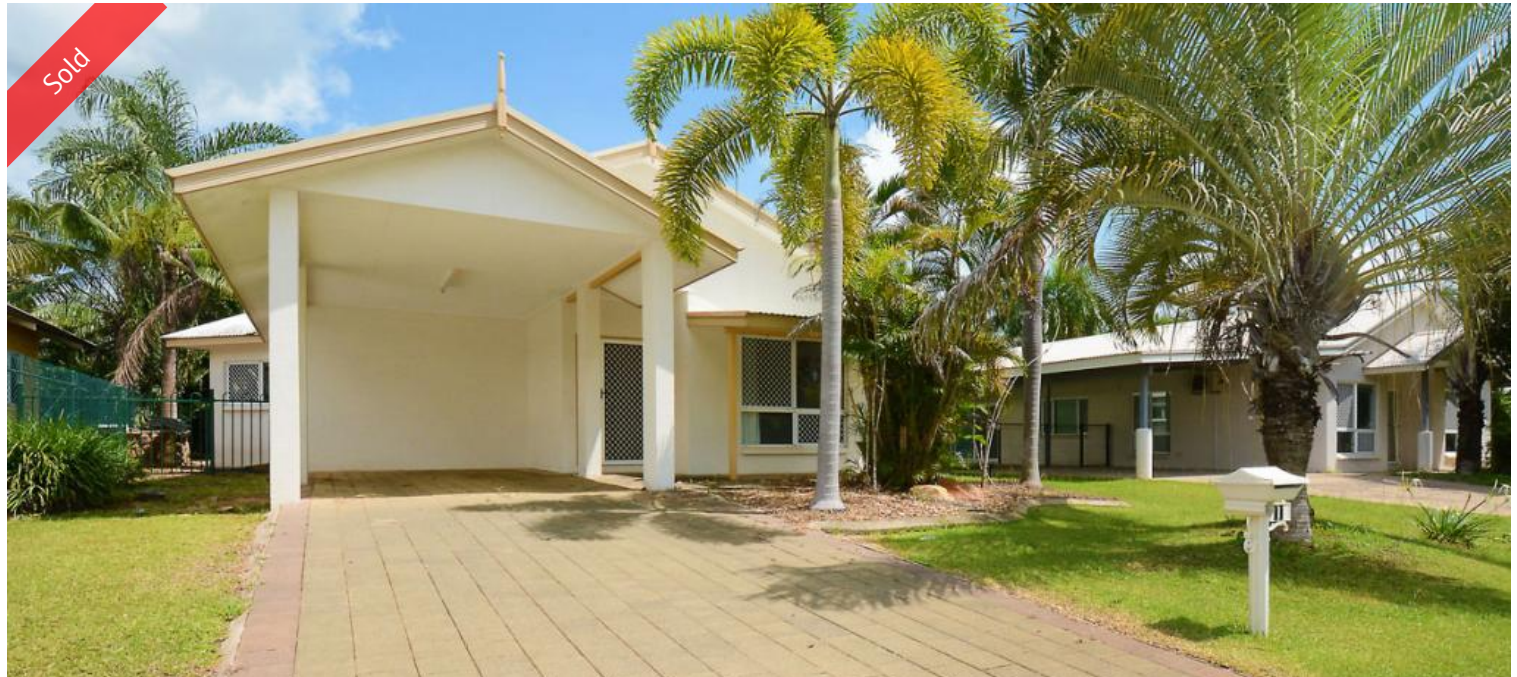
11 Corypha Circuit, Durack