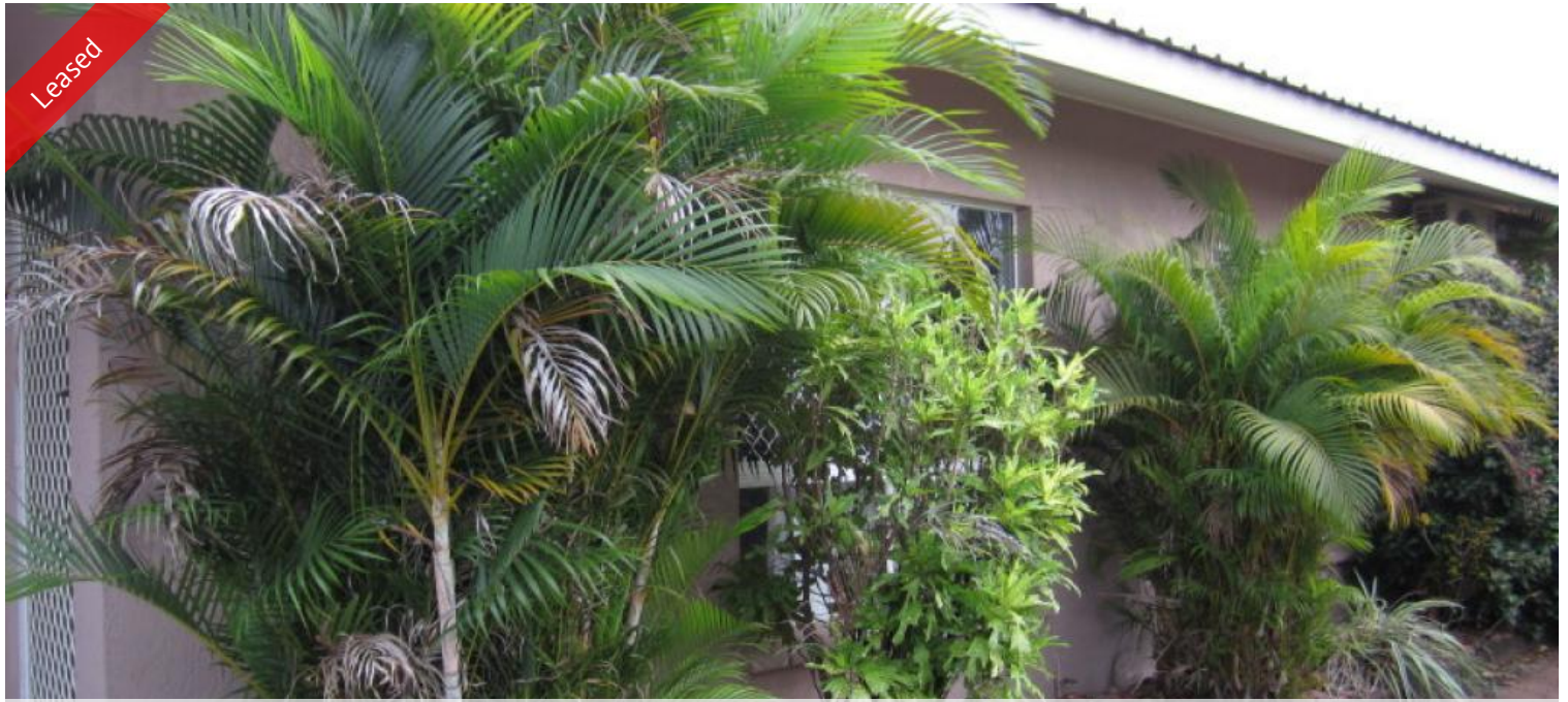
Unit, 80 Forrest Parade, Bakewell