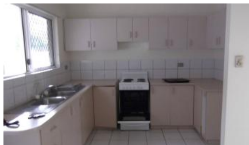
Unit 4, 75 Dwyer Circuit, Driver