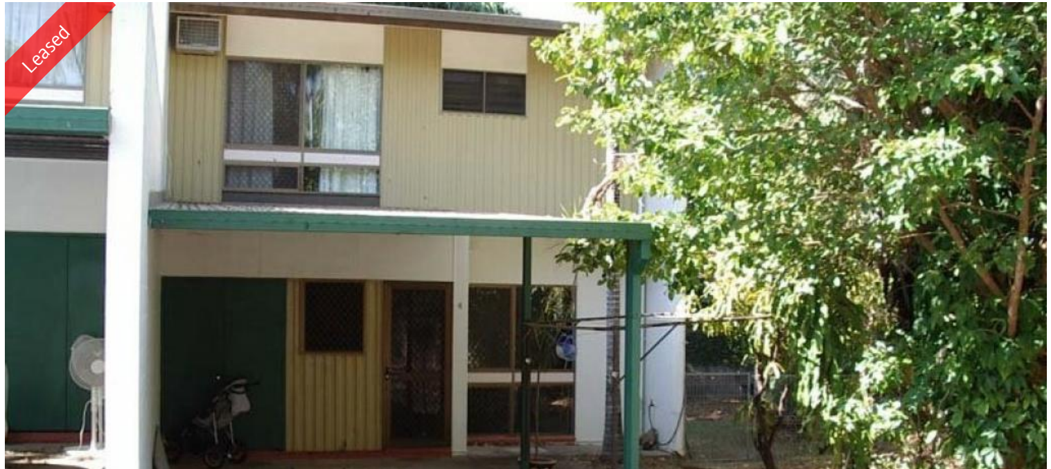
Unit 4, 9 Winston Avenue, Stuart Park