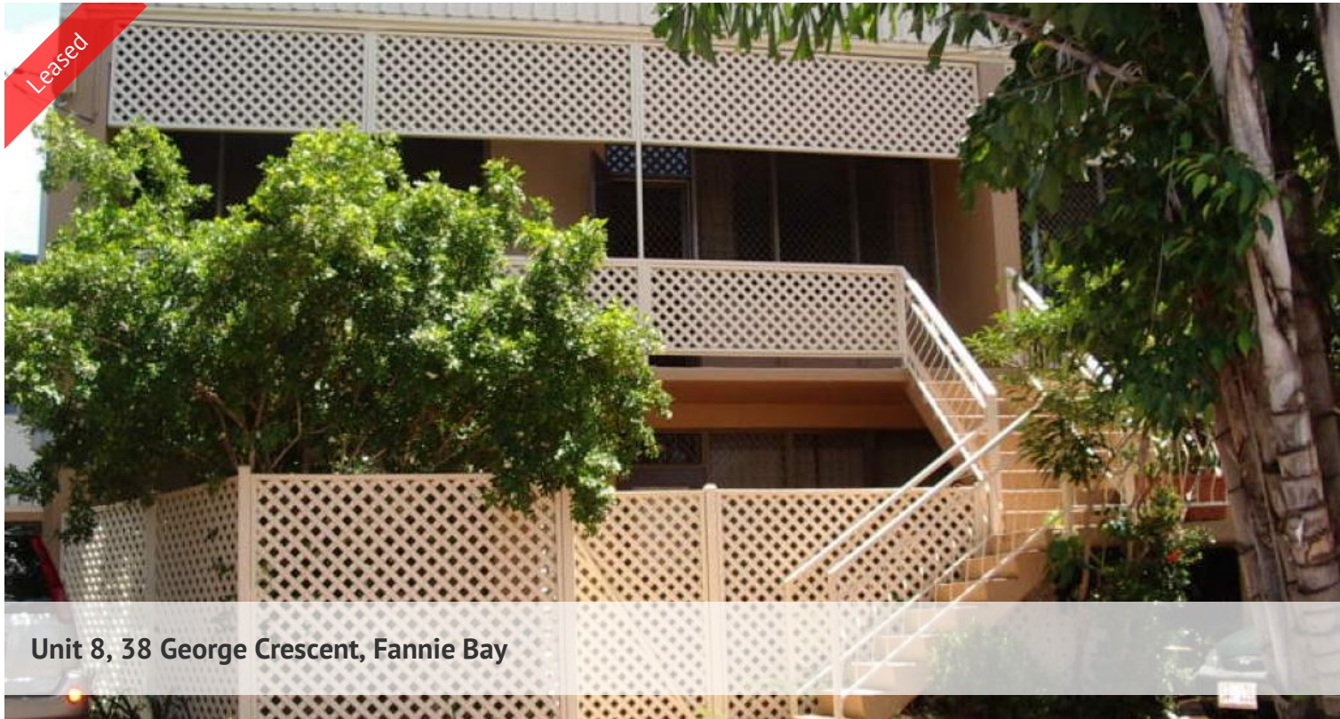
Unit 8, 38 George Crescent, Fannie Bay