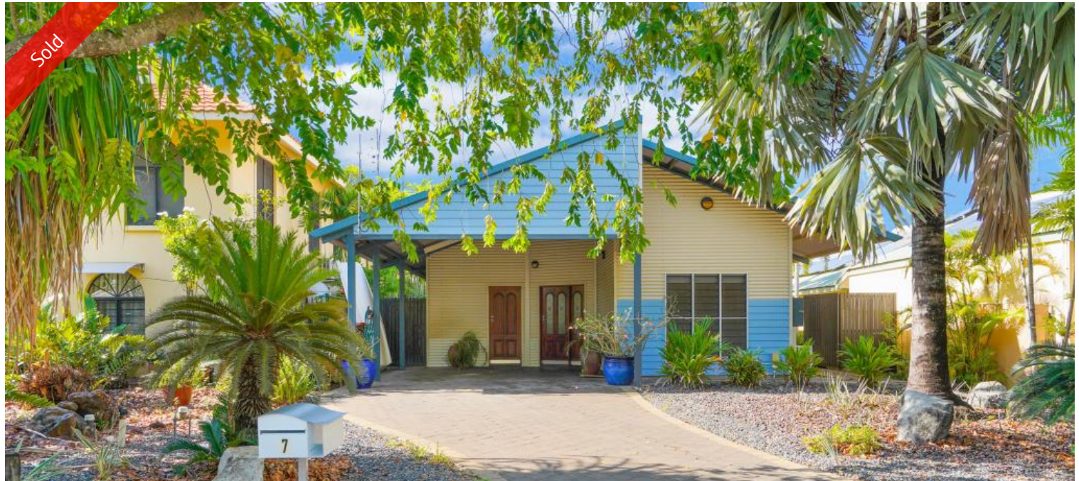
7 Trochus Cres, Woolner