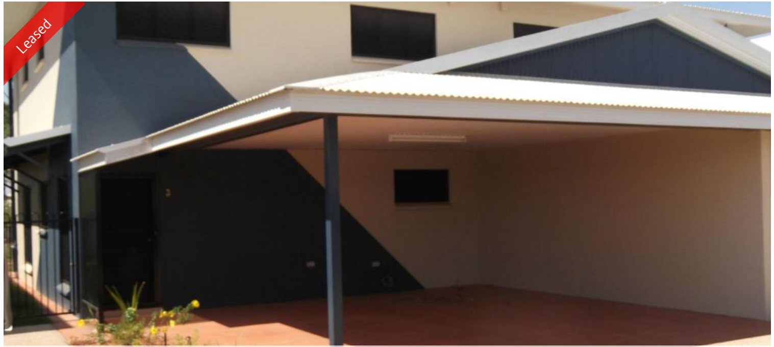
3, 11 Annunciata Street, Bellamack