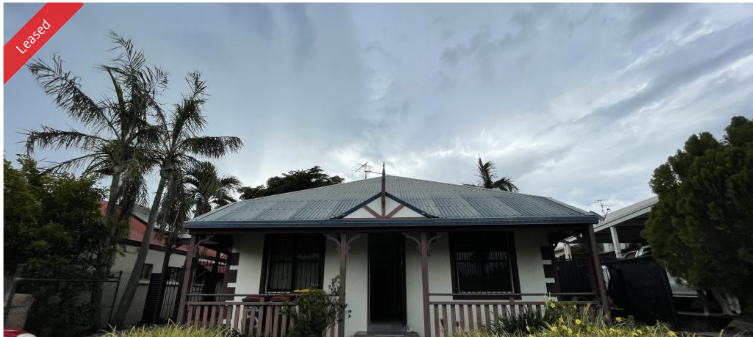
5 Maximillia Court, Durack