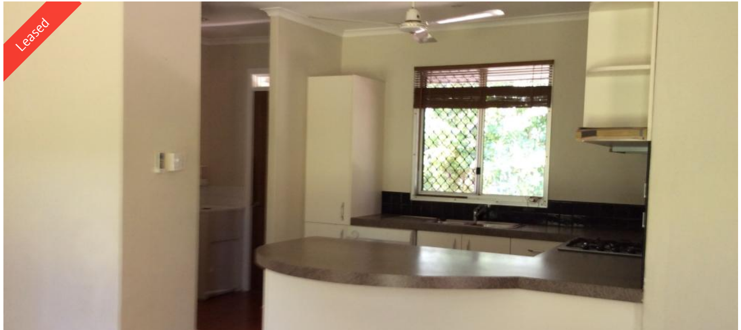
2 Nandina Ct, Leanyer