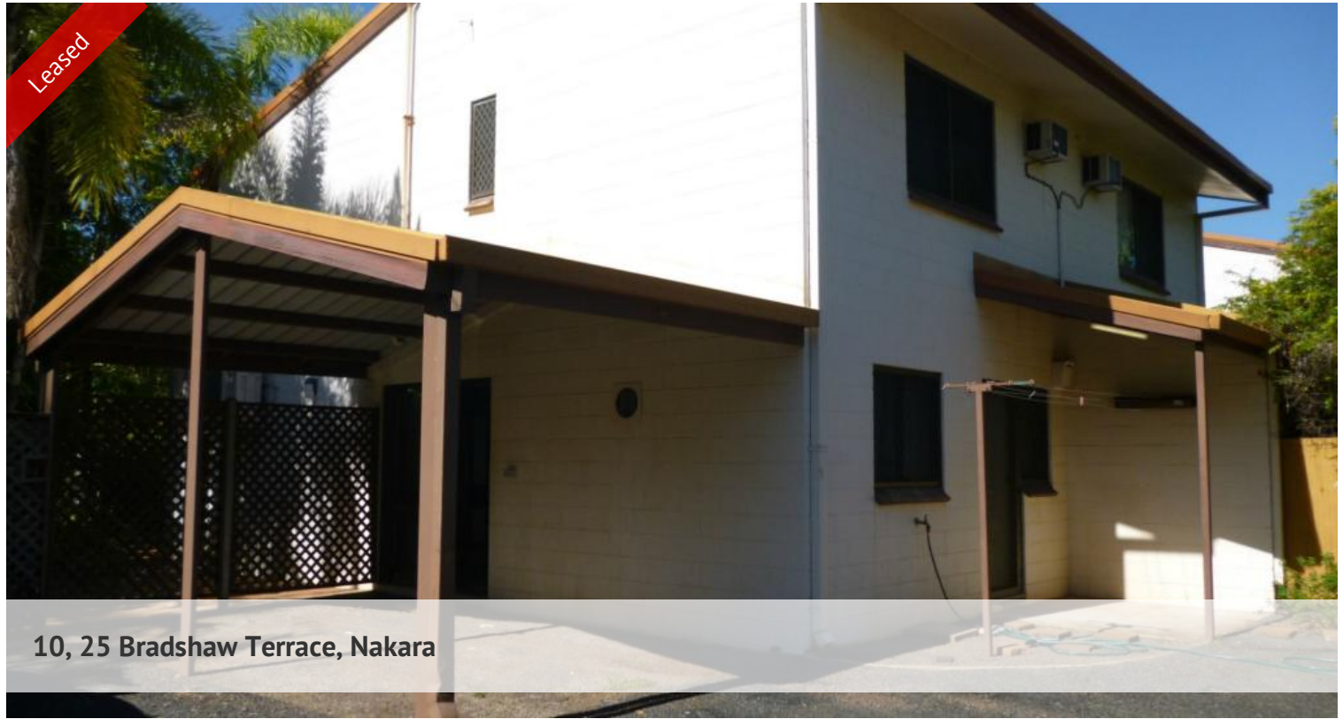
10, 25 Bradshaw Terrace, Nakara