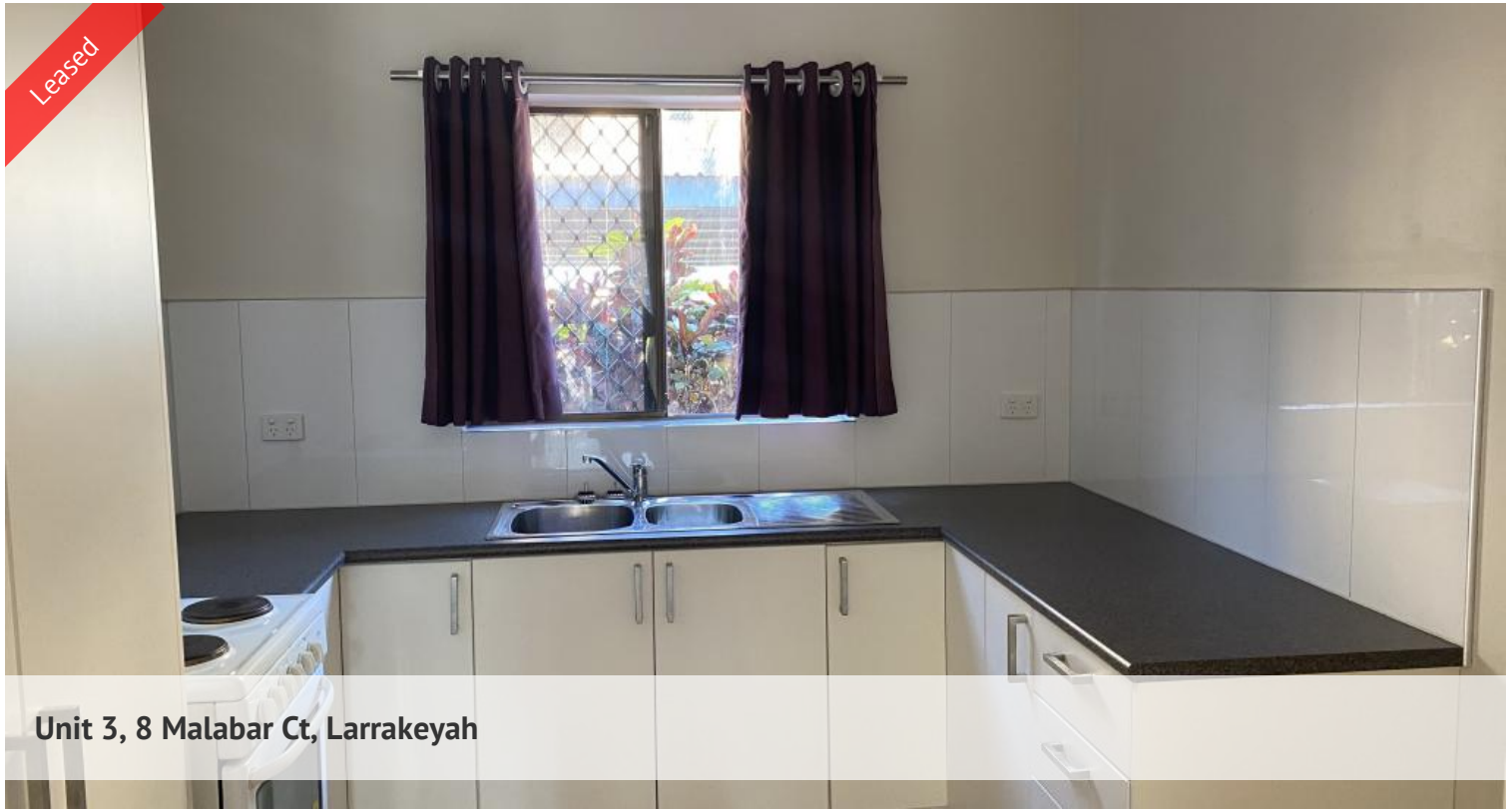
Unit 3, 8 Malabar Ct, Larrakeyah