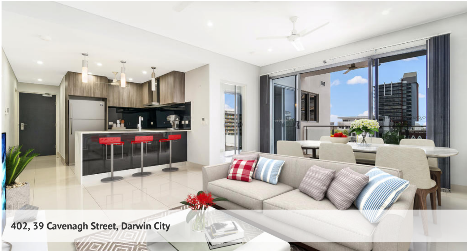
402, 39 Cavenagh Street, Darwin City