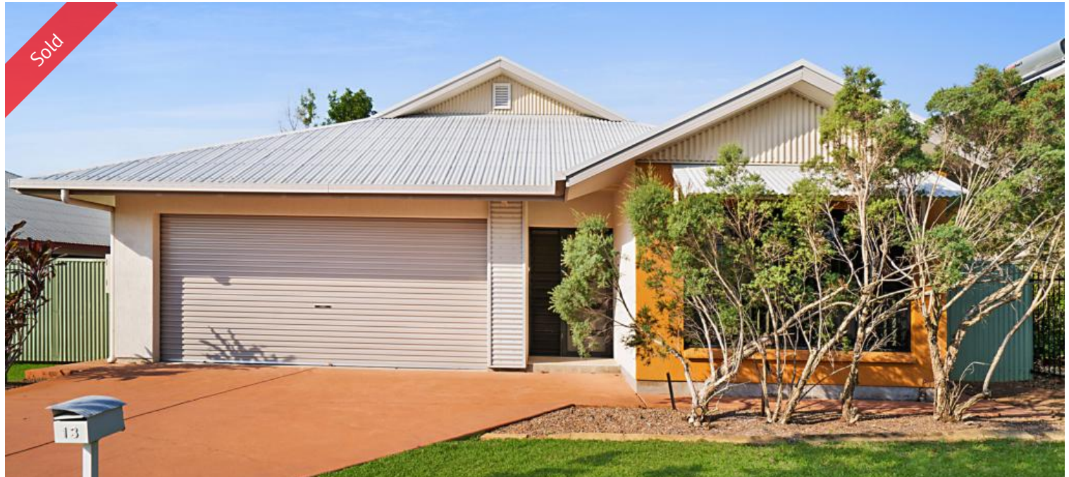
13 Danimila Tce, Lyons