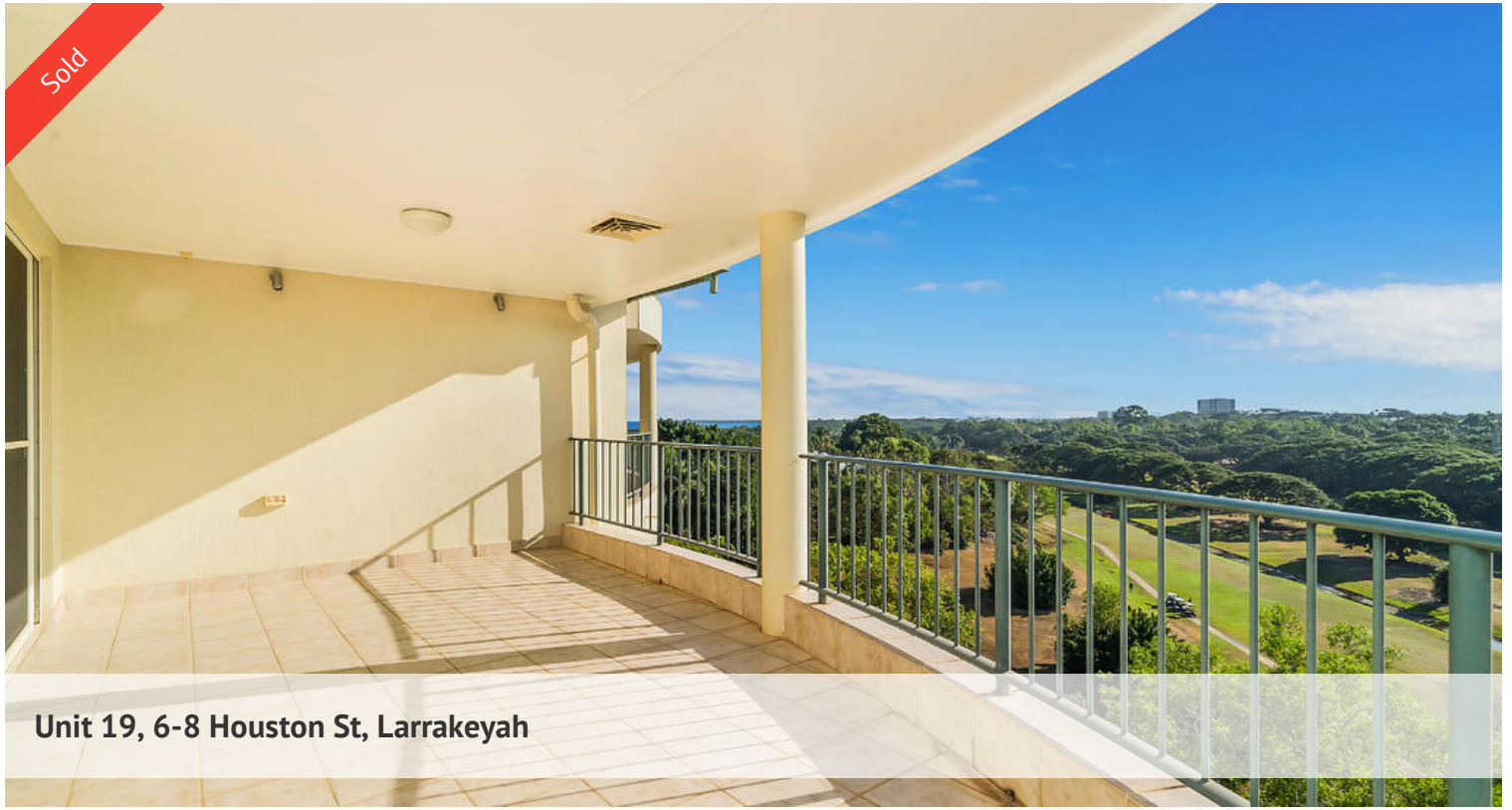
Unit 19, 6-8 Houston St, Larrakeyah