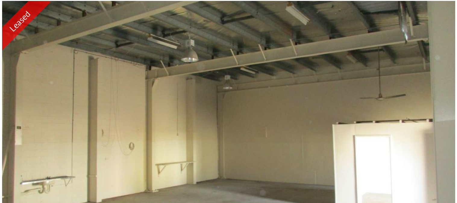
Tenancy 1B/34, Lot 5459 Bishop Street, Woolner