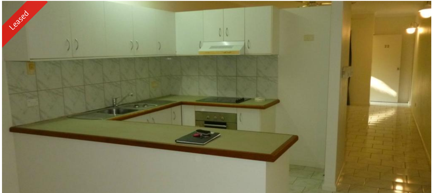
22, 152 Casuarina Drive, Nightcliff