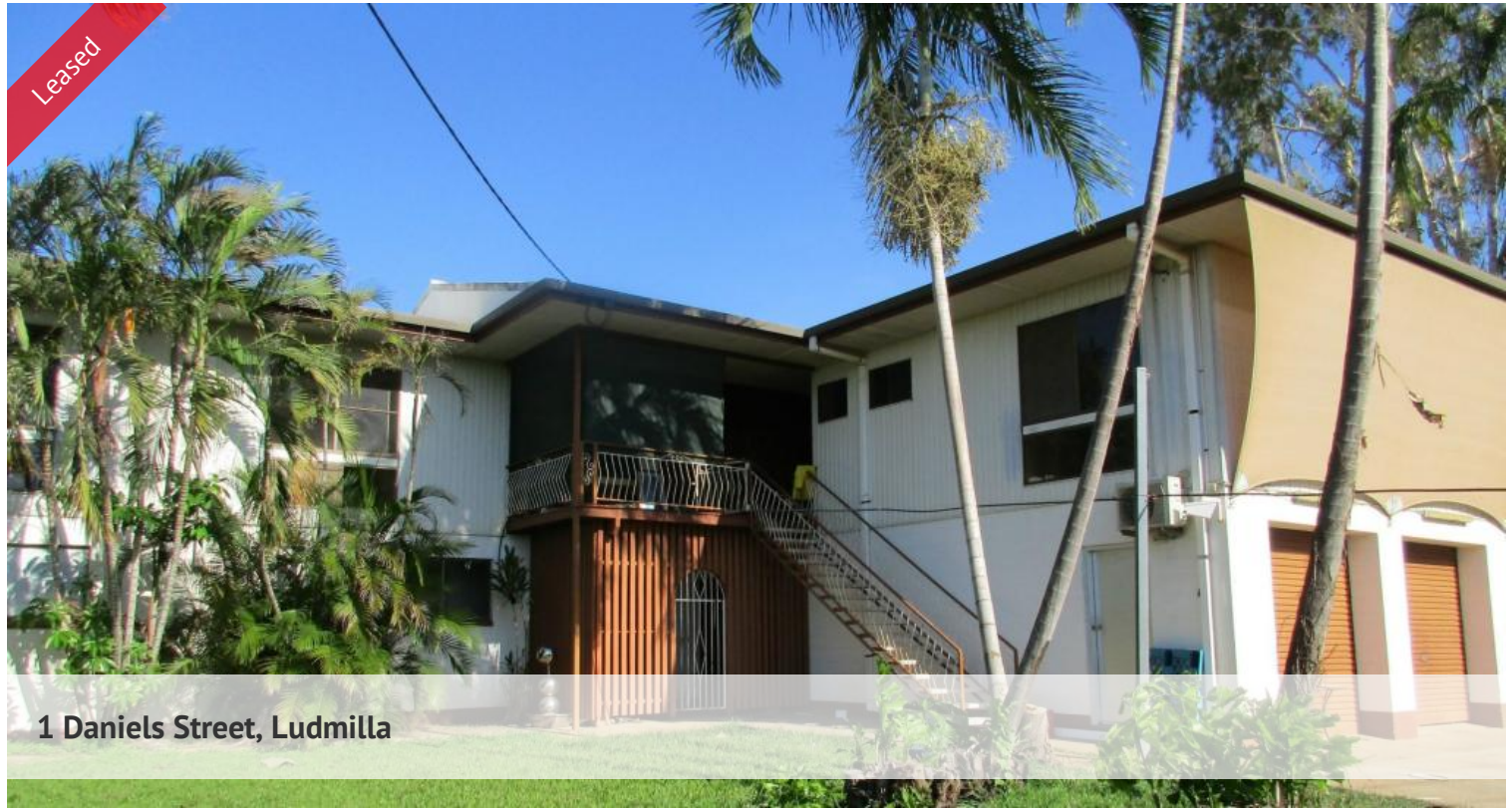
1 Daniels Street, Ludmilla